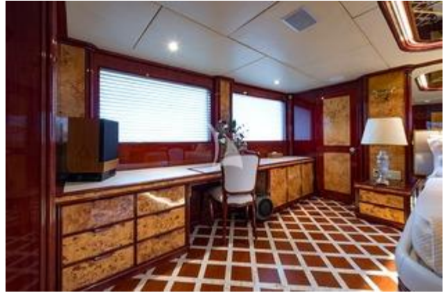
Master cabin desk