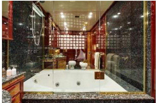
Master bathroom jacuzzi