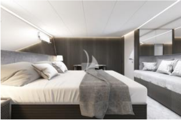
Double cabin with sofa bed - rendering