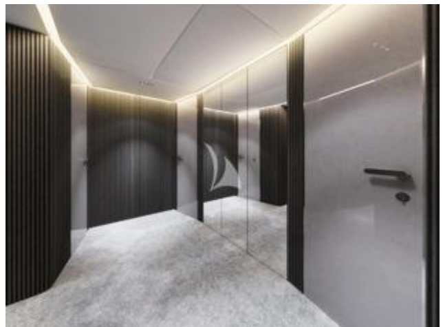
Lower deck foyer - rendering