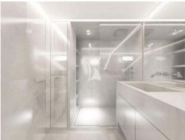
Double cabin bathroom - rendering