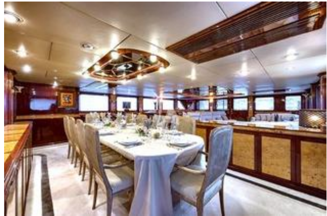
Main salon formal dining