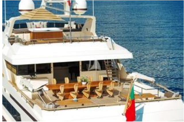
Upper deck and sundeck