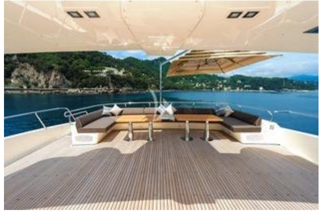
Sundeck lounge area