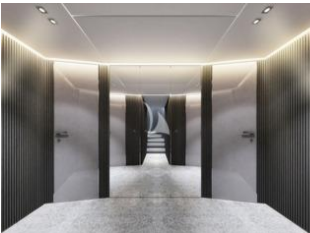
Lower deck foyer - rendering