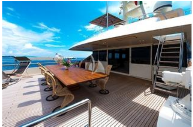
Upper deck alfresco dining