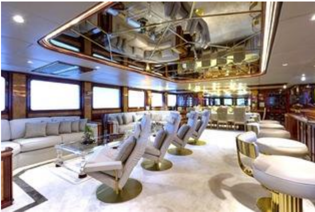
Main salon lounge and bar