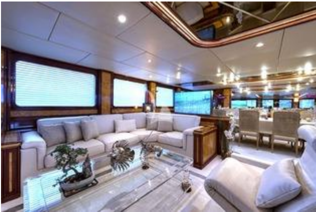
Main salon lounge