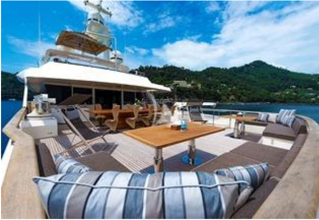
Upper deck lounge area