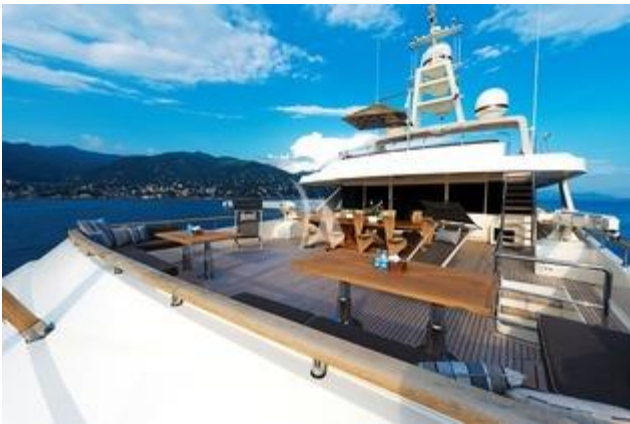
Upper deck lounge area