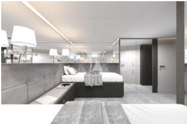
Twin cabin 2- rendering