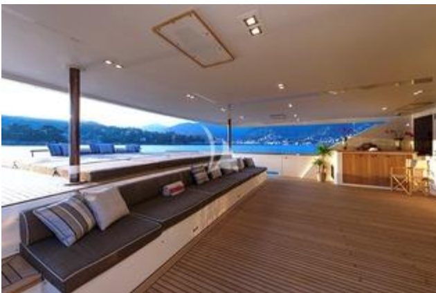
Main deck sofa