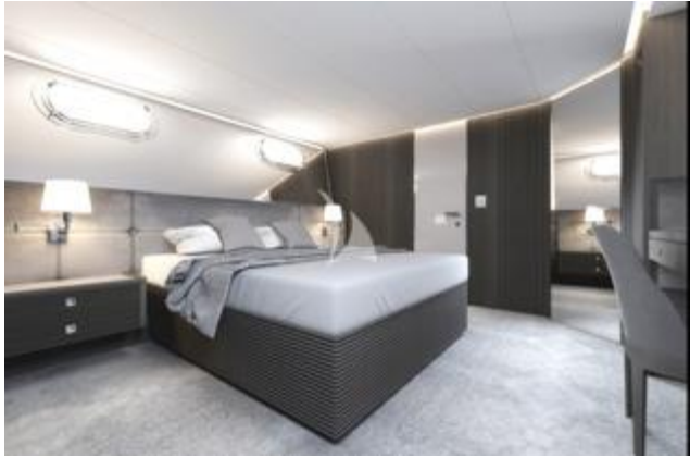
Double cabin - rendering