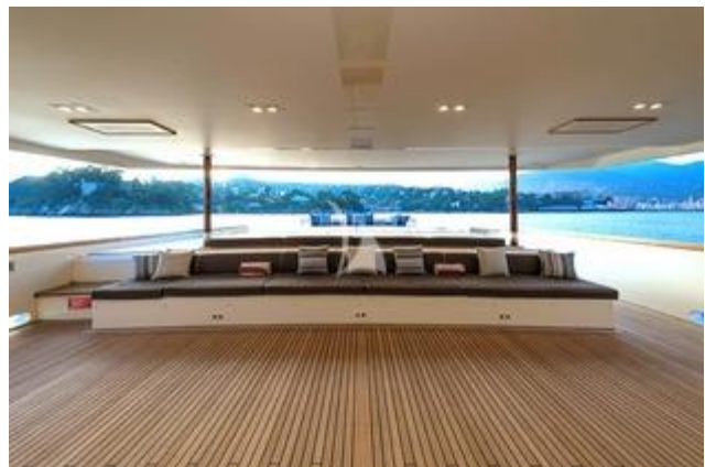
Main deck solarium