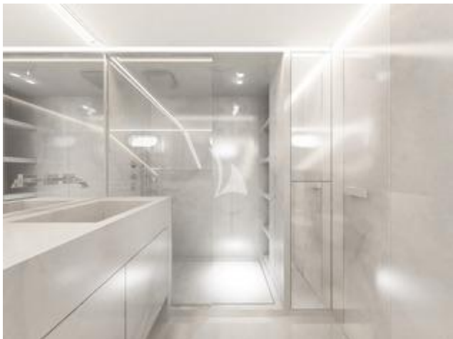
Double cabin bathroom - rendering