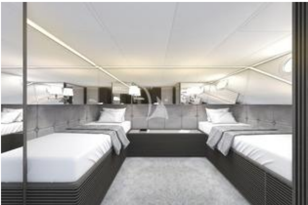
Twin cabin 1- rendering